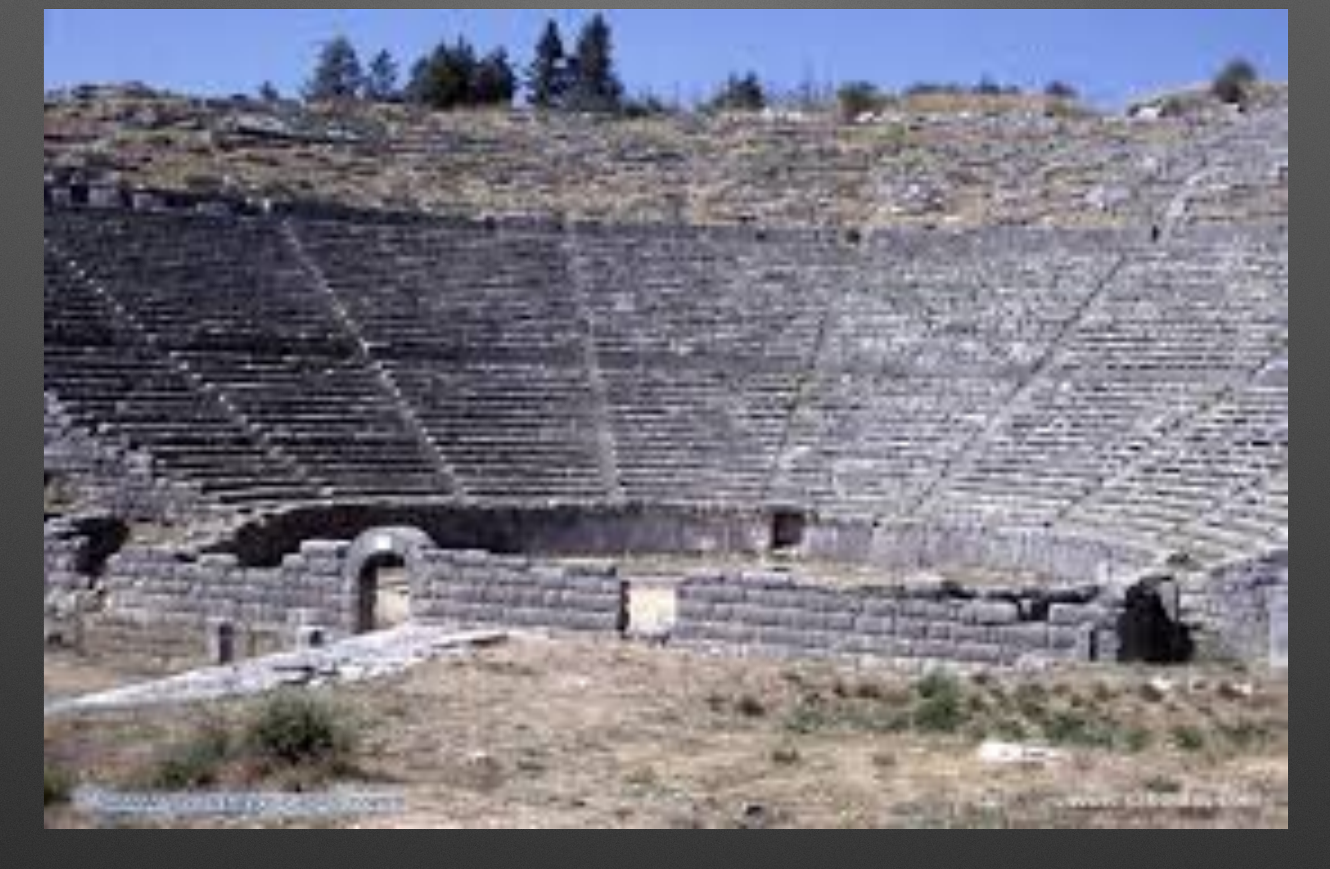
THE GREEK WORLD